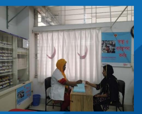
CRP-Physiotherapy and Recruitment of Differently able members