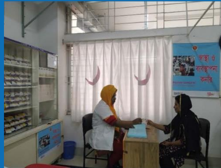
CRP- Physiotherapy and Recruitment of Differently able members